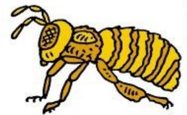
HONEYCOMB AND BEE