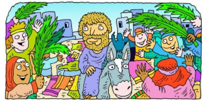
Lots of people came along the road. They were so happy to see Jesus! People put their coats on the road for little donkey to walk on.

They found the little donkey where Jesus had said. They told the man who owned the donkey that Jesus needed it to go to Jerusalem and took the little donkey back to him.