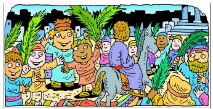
Everyone was happy to see Jesus. "Hosanna to the King," they shouted as Jesus went up the road into the city of Jerusalem.