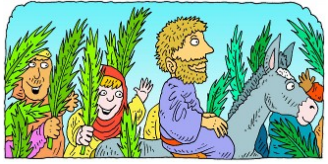
Some people picked palm branches from palm trees growing by the road. They waved the branches as Jesus past by.