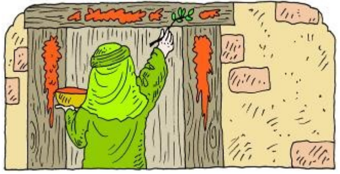
Take a small branch and paint the blood of the lamb around the door frame. It will keep you safe from the sickness I will send on the land," said God.