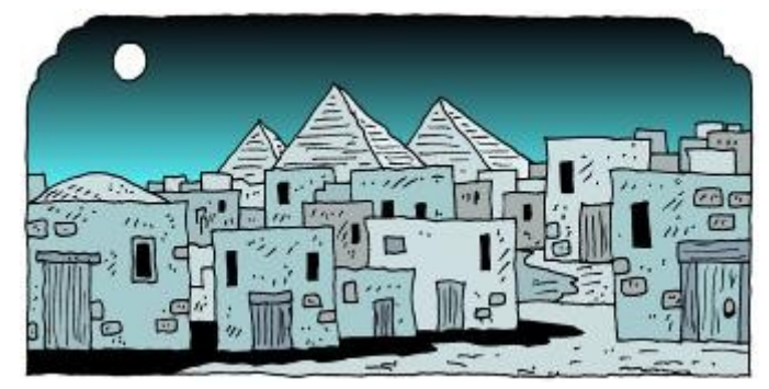
"Stay inside your house because God's angel will pass through the city. Pharaoh's people will get sick and die because he will not listen and let God's people go.