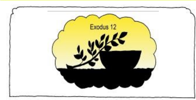
Pharaoh would not let his slaves, the children of Israel, go. God did many miracles until Pharaoh changed his mind.