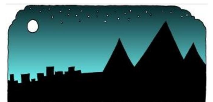
That night the angel of God passed over the city and even Pharaoh's own boy got sick and died. But God kept the families of Israel safe.