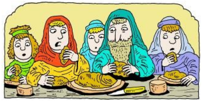
So the families of Israel did as God told Moses and prayed that God would keep them safe. Soon they would be free from Pharaoh and go to a new land God had promised them.