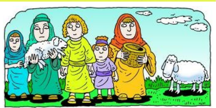
God told Moses, "Tonight every family of Israel must eat a meal of roast lamb, with herb sauce and flat bread. This will be called the "Feast of the Pass Over.