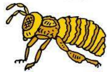
HONEYCOMB AND BEE